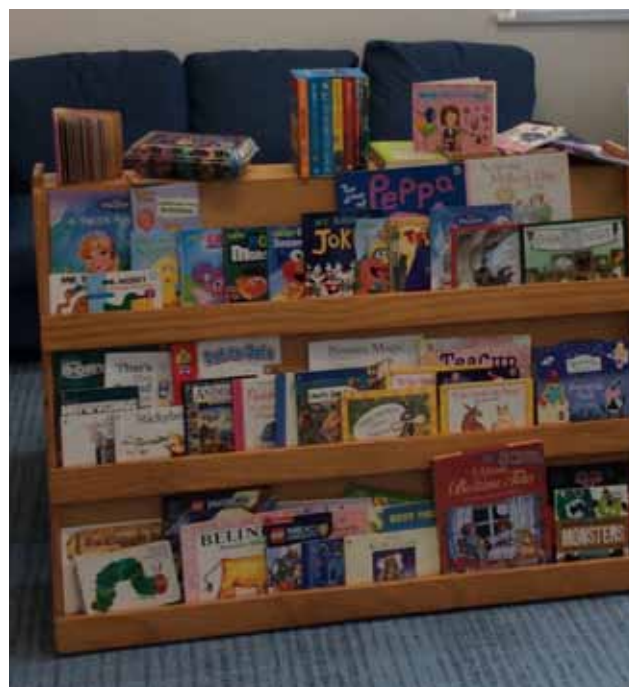
Seawinds Community Hub and Fusion