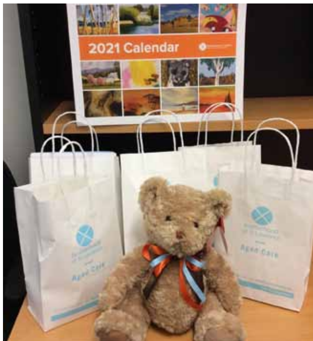
Brotherhood of St. Laurence