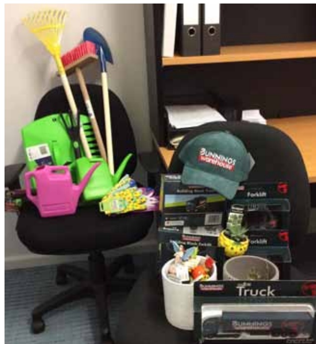
Bunnings Warehouse Frankston